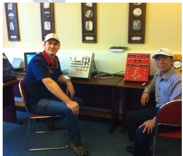
100% Perfect (The Full Bottle)

Candidates who successfully achieve 100% in their well control exams win entry to our exclusive club for high achievers, The Full Bottle Club , have their achievement recognised on our website, and receive a complimentary bottle of our Well Controlled Cabernet.