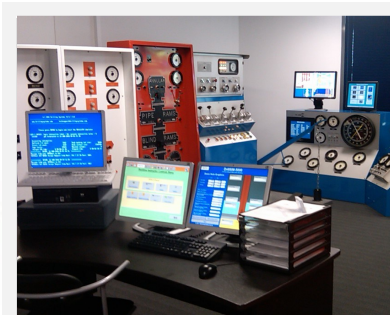
Rig Floor Drilling & Workover Simulator at our Perth Training Centre